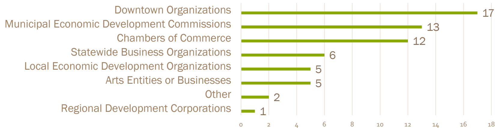
Types of Applicants Receiving Awards