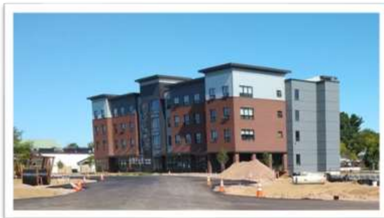
Allard Square by Cathedral Square