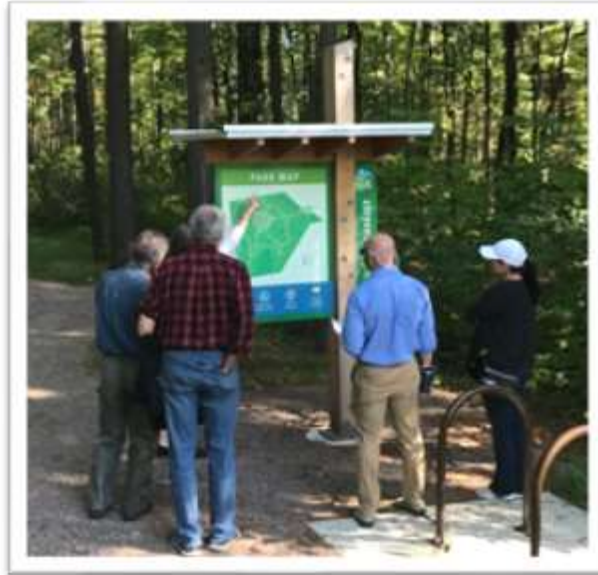
City Center Park Map