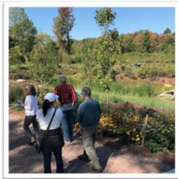
Integrated Recreation & Stormwater Facility

buildings. The City purchased a parcel from SBCC, LCC in order to construct the new City Hall/Library which is presently under construction. University Mall ownership has changed due to bankruptcy but local management has stayed the same and dialogue for infill development continues.