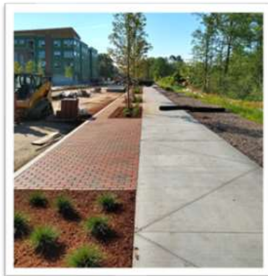
Market Street Prior to Opening