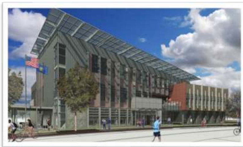
New City Hall, Library & Senior Center Now Under Construction

The South Burlington Public Library and City Hall (a new three-story building) is scheduled to open summer 2021.