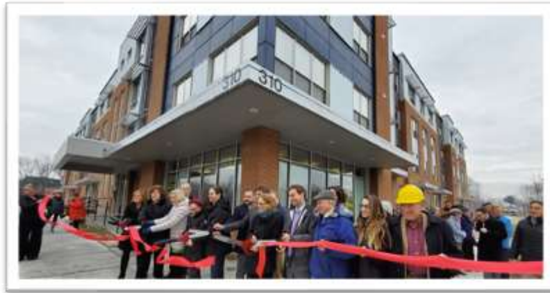
Garden Apartments by Champlain Housing Trust