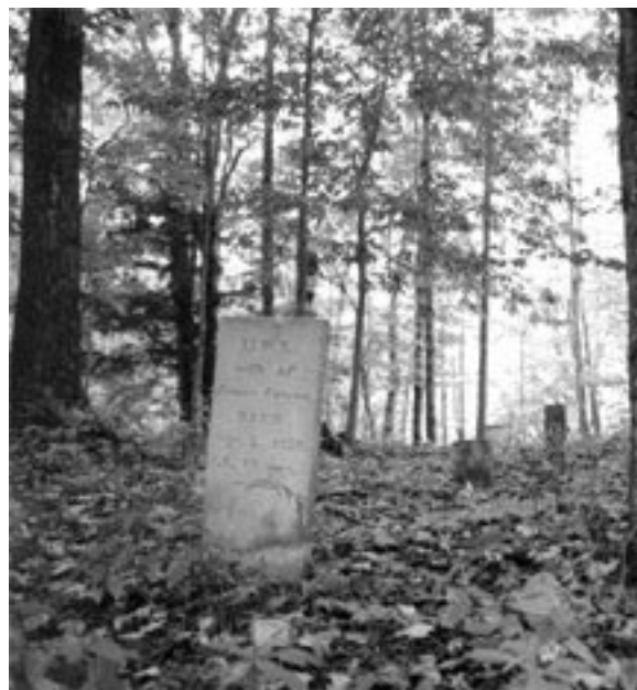
Left, Woodburn gravesite in Windham; Right, Old cemetery–Mendon