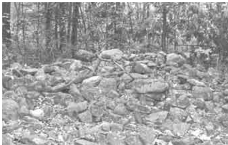
Stone pile in a former potato field—Chester

Sometimes a local name indicates how the fields were formerly used: "Potato Hill" in Chester was an area where potatoes were grown. In this formerly cultivated field are found the stone piles with small stones and cobbles.