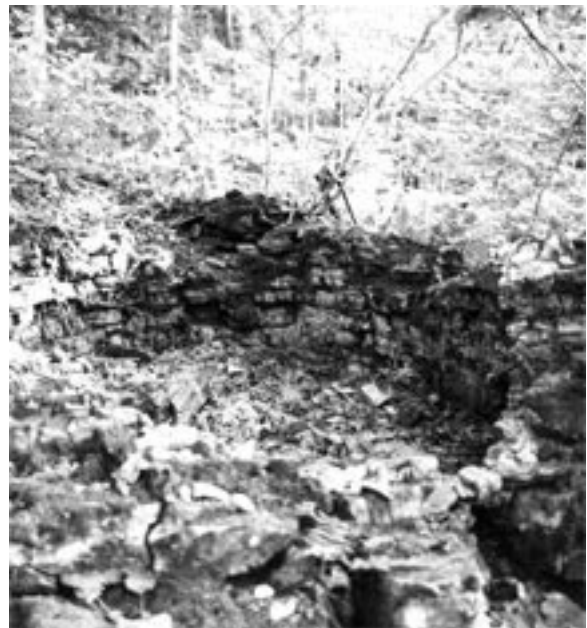
Left, Lime kiln fire opening (note charcoal)–Weathersfield; Right, Top of blast furnace–Dorset