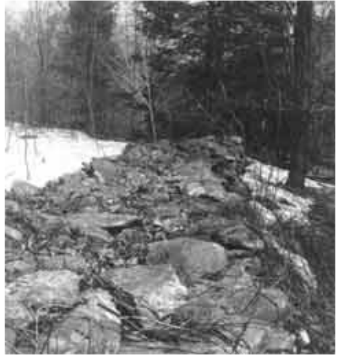
Left, Stone wall; Right, Stone wall with infill—both from Shrewsbury.