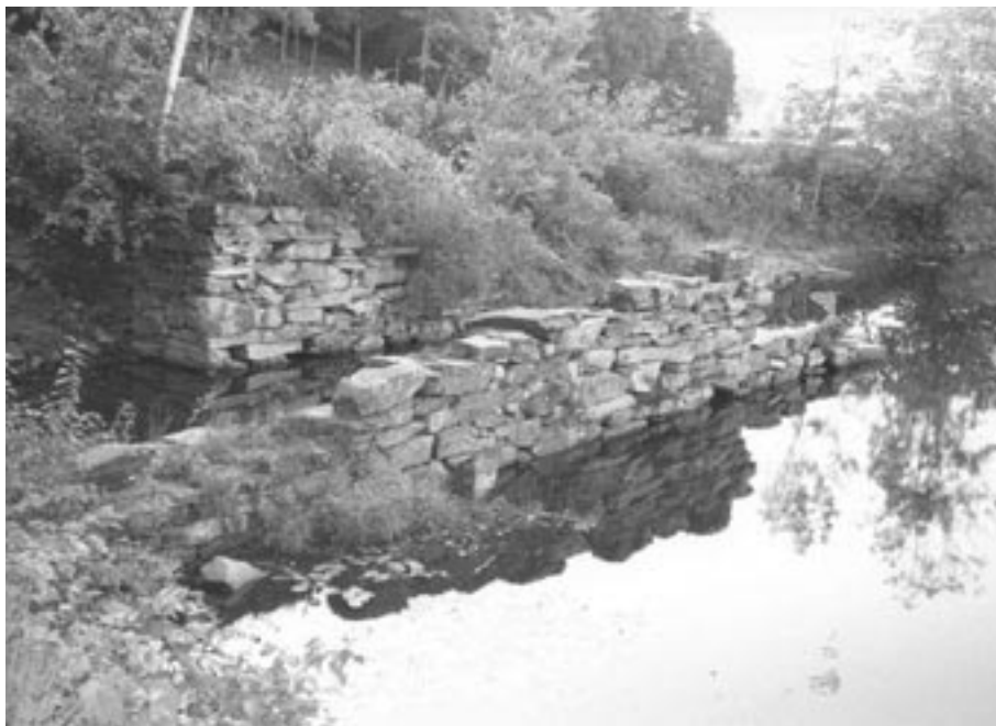
Remains of a sawmill–Bartonsville

Artifacts associated with mills may still be present such as grindstones, the large circular stones that were turned to pulverize grain to convert it to flour. The most durable parts of a mill are stone dams and causeways; these are the remnants you’ll likely find. If the dams were made of wood cribbing and earth, these are probably gone; years of spring floods have washed out or rotted out these structures.