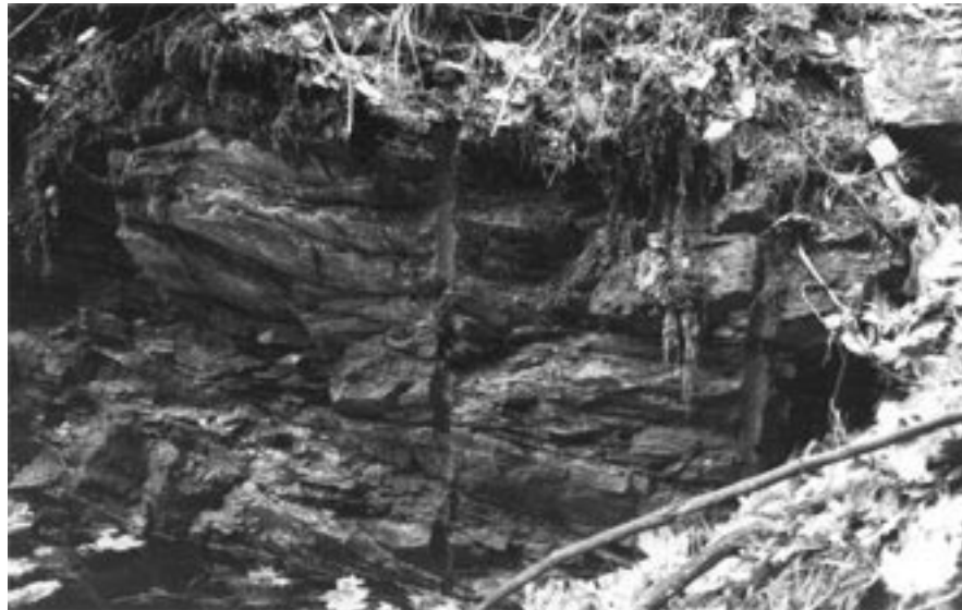
Abandoned slate quarry' note vertical drill marks