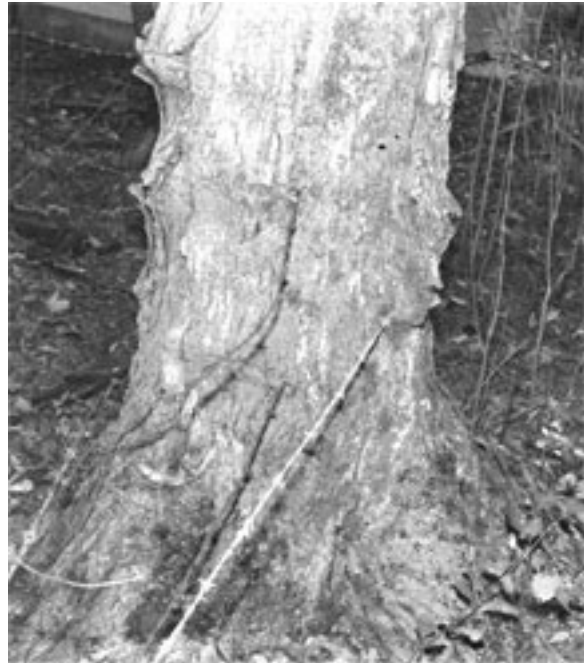
Left, Property boundary corner marker; Right, Fence wire imbedded in trees can indicate boundary evidence.