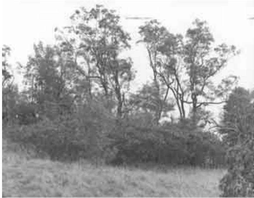
Black locust and sumac near an old foundation—Monkton

The so-called "front yard" didn't become widespread until after 1820. You'll find evidence of the front yard around many foundations. One indicator is remnant shrubs and flowers. The shrubs include lilacs, which might have been planted in clumps on each side of the front door, or in a line to form a hedge. By some foundations, you find the front lawn trees, often two sugar maples at either end of the front yard. Other front yard plantings include roses, day lilies, morning glories, hydrangeas and periwinkle. Occasionally you will also find a stone wall foundation defining the front lawn, where the lawn was on a steep bank and had to be built up to make it level and usable. Later in the 19th century, more exotic trees were planted near the house and in the front yard; these included black locust, white poplar, and Lombardy poplar. Old specimens are still found around some cellar holes.