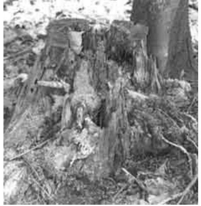
Left, Remains of a sugarhouse (note buckets); Right, cut stump, 40+ years old

forwarders. A tree will grow new wood around a wound. The thickness of the callus tissue that grows over the wound is an indication of how long ago the logging injury occurred.