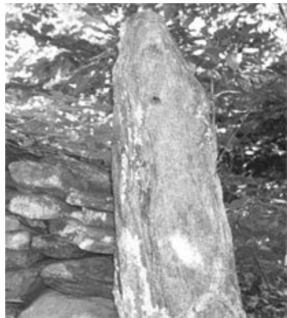
Left, Remains of a wooden pipe; Right, Stone post with drilled hole.