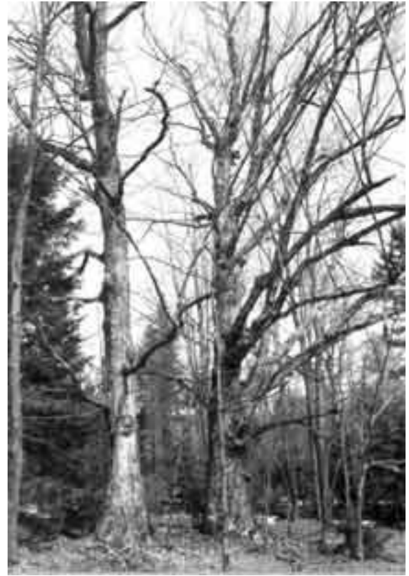
Left, Overtopped apple tree; Right, "Monarch Maples" in an old sugarbush