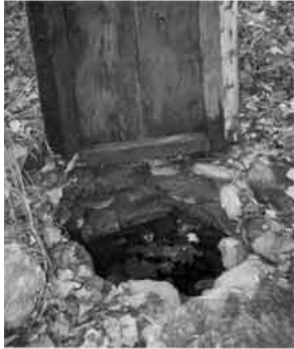
Left, Example of split arch chimney foundation—Chester; Right, Stone-lined well

Other stonework found around the house include steps. Stone steps, often large, flat stones, may lead down into the cellar. Often you find stone steps leading to the top of the foundation from the outside of the foundation wall; these were the steps up to the front door or side door. (See photo on page 49.)