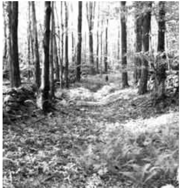
Left, Stone culvert; Right, Old road–Jamaica